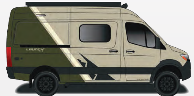
Forest Glade Partial Paint (sandstone van only)