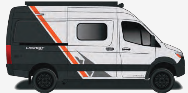
Aztec Partial Paint (silver van only)