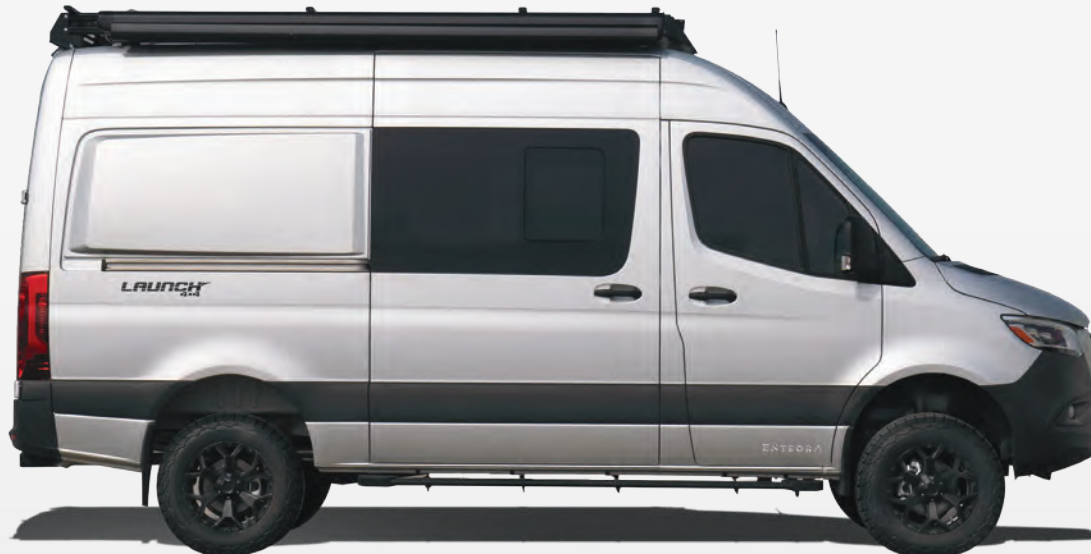
Standard Exterior (silver or sandstone)